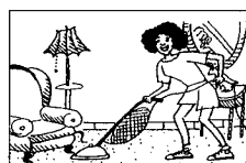
4. Soledad (limpiar)