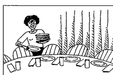
7. Yolanda (poner)