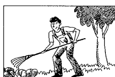
8. Cristóbal (trabajar)