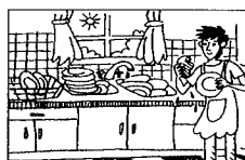
3. Gilberto (lavar)