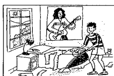
5. Esteban (pasar)